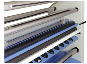
Cantilevered Supply Shaft*